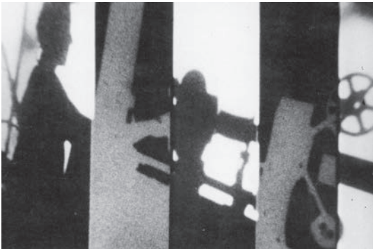
Figure 1. An optically printed shot of filmmaker Barbara Hammer at work on her JK optical printer ( Endangered , 1988).

Additionally, I claim that the widespread adoption of the optical printer influenced filmmaking aesthetics, as the avant-garde's long-standing investment in perceptual transformation shifted from in-camera effects to post hoc manipulation of footage. Emboldened by the Bolex H16 camera, the first-generation postwar avant-garde relied heavily on in-camera techniques such as superimposition, slow and fast motion, and pixilation, as exemplified by films such as The Cage (Sidney Peterson, 1947) and Go! Go! Go! (Marie Menken, 1962–1964). For later generations, the optical printer refigured the process of shooting as gathering raw material to be revised later. Images became susceptible to rhythmic alteration, repetition and multiplication, and being slotted into grids, composited with other images, or used in conjunction with techniques like hand processing and backlighting (see Figure 1). Furthermore, avant-garde optical printing is more diverse than usually assumed, as the device proved equally useful for poetic transformation,