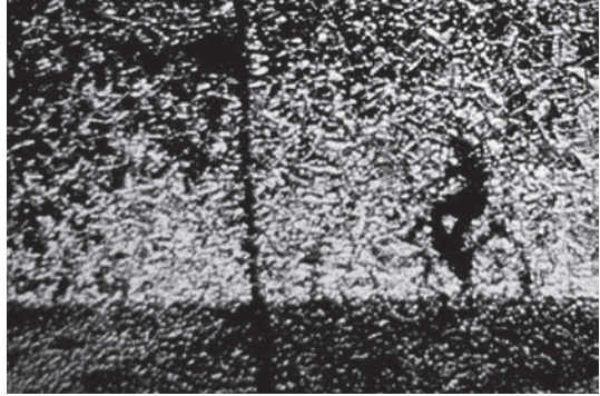
Figure 6. A found image is allegorized by chemical treatments and optical printing in Phil Solomon's Remains to Be Seen (1989).

Conclusion. The ability of experimental and advanced amateur filmmakers to realize complex visual effects has only increased with the advent of digital technology. Just as computer-generated imagery has reified the Industrial Light & Magic aesthetic pioneered by optical effects artists in Hollywood, the basic vocabulary of avant-garde optical printing has become a standard feature of nonlinear editing systems, which allow for highly sophisticated effects with just a few mouse clicks. 80