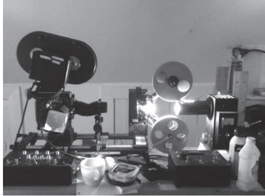
Figure 4. A JK optical printer, model K103.

in motion-picture projectors to convert continuous movement into intermittent movement. This allowed for film to be held in the gate without slipping or strobing during rephotography. Kurhi's printer used a step motor to advance the film through completely intermittent movement. Although this was a more laborious, time-consuming process, it eliminated expensive parts, which allowed the printer to be manufactured at low cost. The K103 came equipped with other features, including a 300-watt ELH lamp, a bellows for magnification and reduction, and a control keyboard for the step motor. Filmmakers could replace many of the pieces at their discretion.