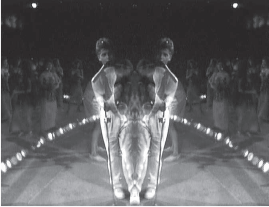
Figure 7. An optical printing aesthetic refigured for Final Cut Pro in Light Is Waiting (Michael Robinson, 2007).

shots were then rendered in slow motion, and Robinson created an “artificial” flicker by copying and pasting frames of solid color (red, white, and blue) and layering them over the image tracks. Despite the fact that Light Is Waiting prominently displays video artifacts as the image breaks itself down, Robinson claims that his effects were “definitely informed by my experiences with analog film ‘special effects.’” 83 Additionally, this hands-on process of making small adjustments in Final Cut Pro is analogous to the frame-by-frame logic of the optical printer, but the technology enables Robinson to be far more precise in his compositing.