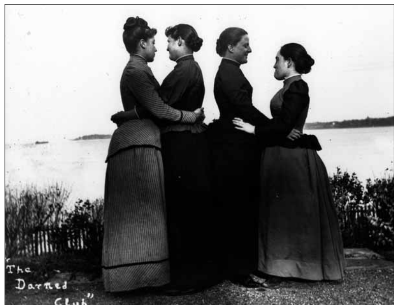
"The Darned Club," by Alice Austen, approx. 1898, as used in Barbara Hammer's The Female Closet .

HAMMER: The textural quality of the abstract film image creates a sense of touch not unlike the language of Lifting Belly where Gertrude Stein keeps words in the continual present through abstraction. If there is no literal representation by the word of a thing or a time (past tense, future tense), by the image (layered, color fields, soft outlines), the physical