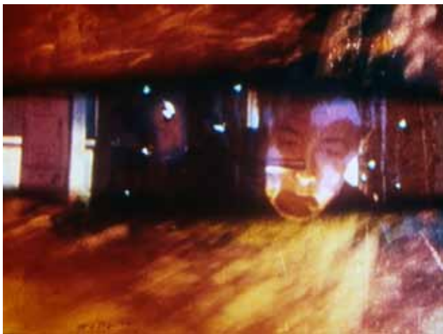
Barbara Hammer, 16 mm film frame from Endangered (1988). Shows the artist working on an optical printer with abstract images.

reading of the word, the image is more stimulating to the mind, which is, of course, part of the body. The entire body then is involved in the “reading” and with the total body involvement touch is brought into play. One could even go so far as to say that since “touch” has been so little studied that it carries as one of our senses an abstract quality. It is also exciting in an intellectual way. Desire is created intellectually, it is something that you don’t have/can’t have. One doesn’t have the “out” as Gertrude Stein is talking about her lover’s multiple orgasms in plain English, but there is the rising belly: “Question and butter. / I find the butter very good. / Lifting belly is so kind. / Lifting belly fattily. / Doesn’t that astonish you.” That kind of thinly veiled abstraction makes us want to know more, generates desire, brings us into the field of desire “two women together in bed.” Or on the kitchen floor—oh my, Gertrude Stein on the kitchen floor, I have work to do [laughs]!