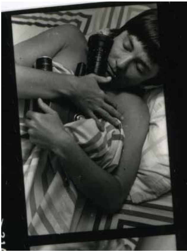
Barbara Hammer, production stills from Sync Touch , (1980).